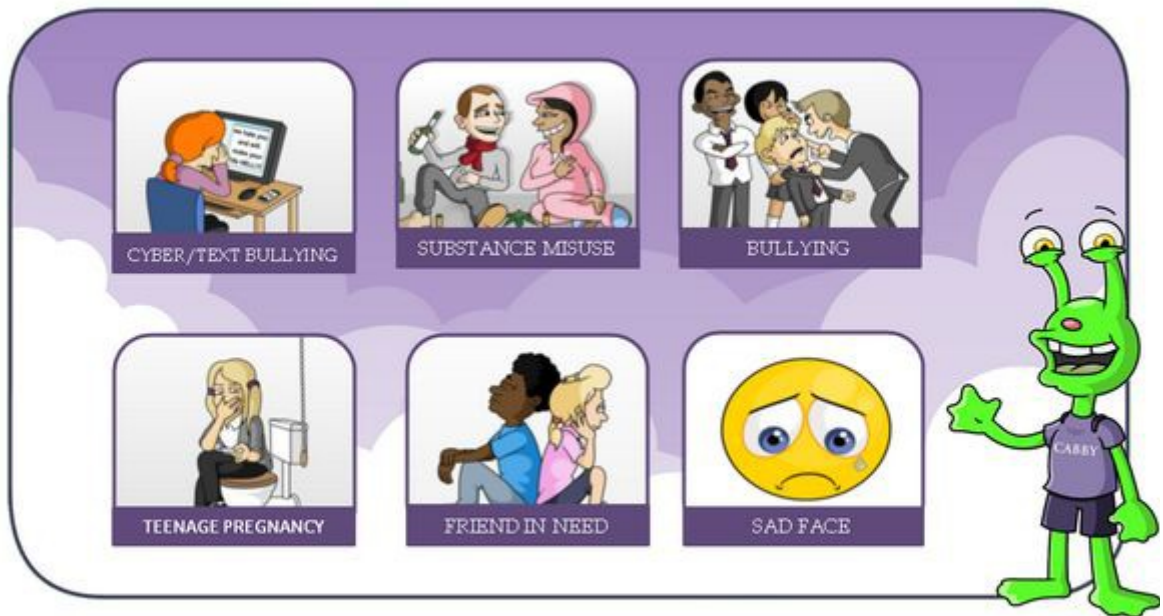
CAABS Version For Middle Schools